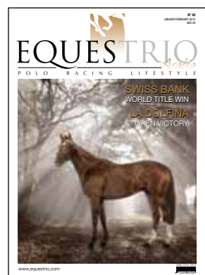
Whistlejacket Fine Equine Photography: New Approach

One of a series of ethereally striking works born out of desire to create emotive portraits of the world's finest horses, this striking image marries the regal elegance of 18th century equine art with 21st century fine art photography. The brainchild of photographers Martin Barraud and Chris Ryan, Whistlejacket Fine Equine Photography breaks new ground in the equine photographic genre and creates new opportunity for owners to commission truly individual works of their most cherished equine partners. We are delighted and proud to showcase an exclusive series of Whistlejacket portraits in the Portfolio section of this issue.